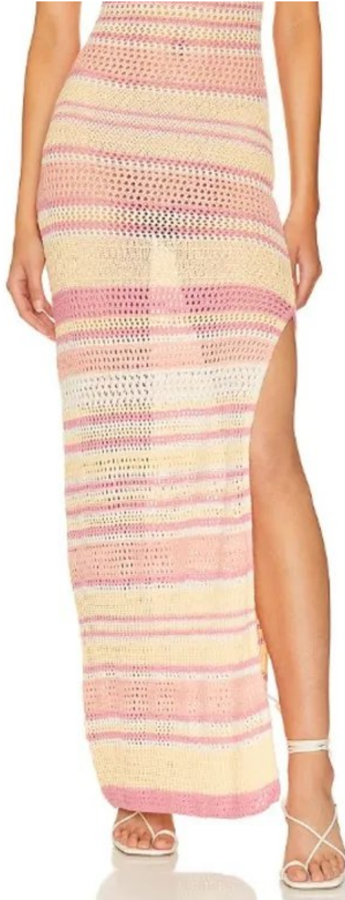
PQ Amelie Maxi Dress, $154