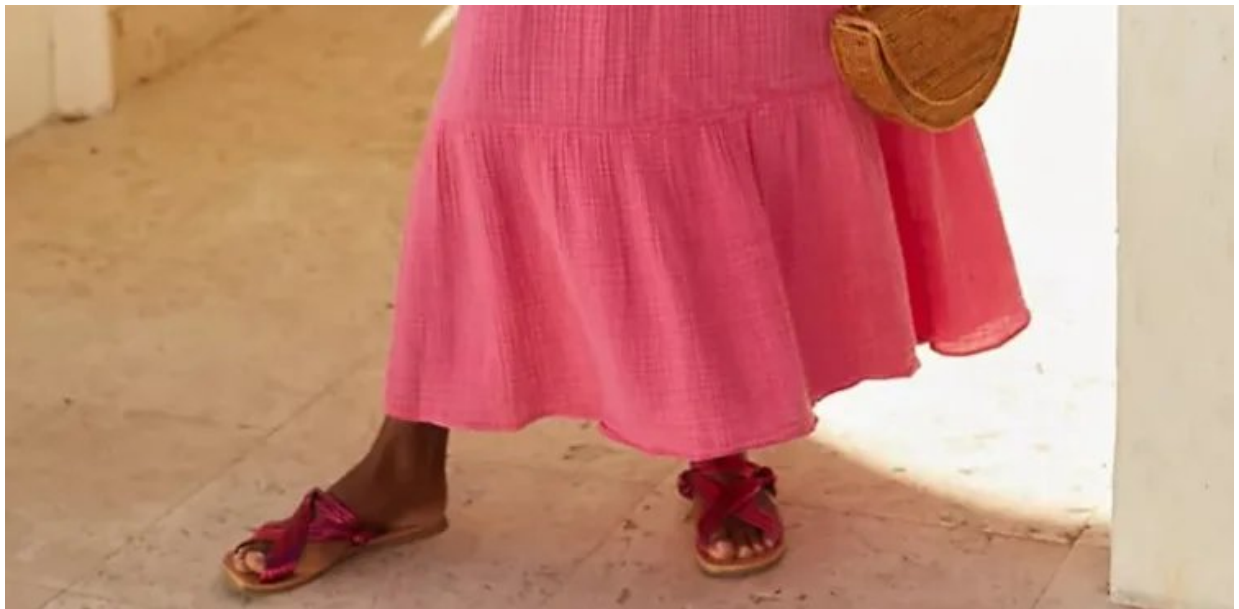
Cleobella Magenta Lalita Mini Dress, $238