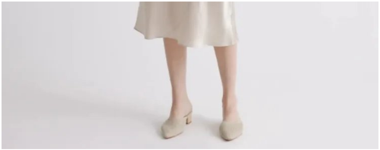
Free People Simply Biased Slip Dress, $60