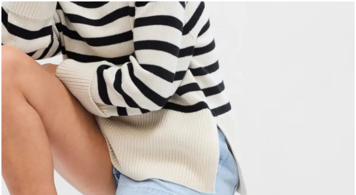
Cider Stripe Collar Knit Top Polo, $28