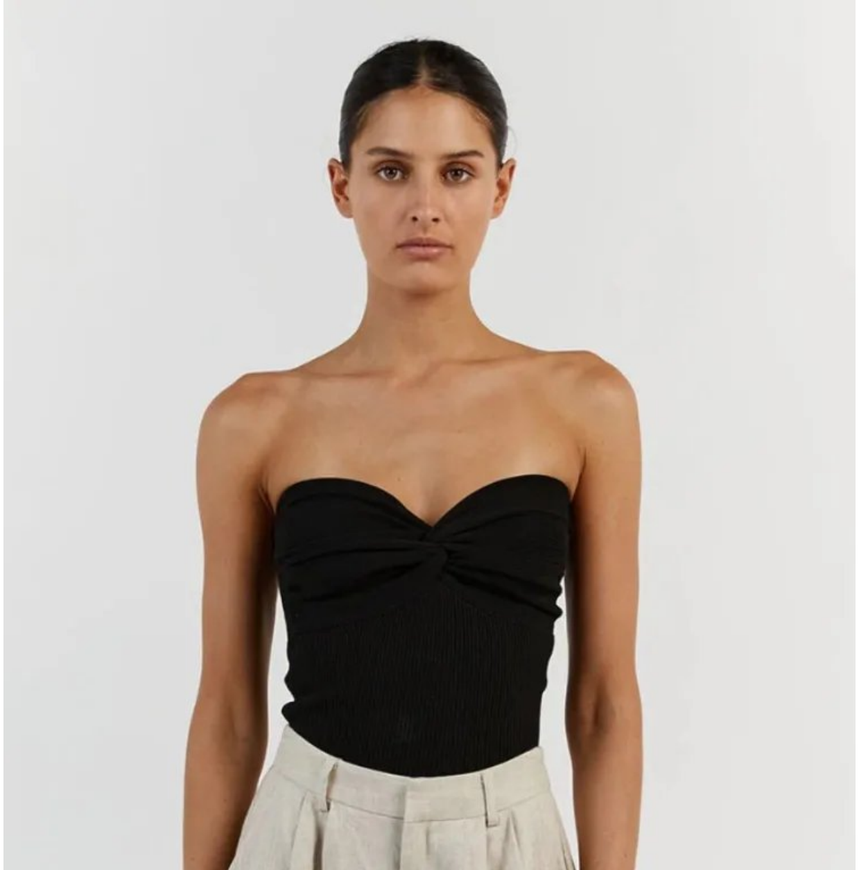
Gap Rib Sweetheart Tube Top, $60