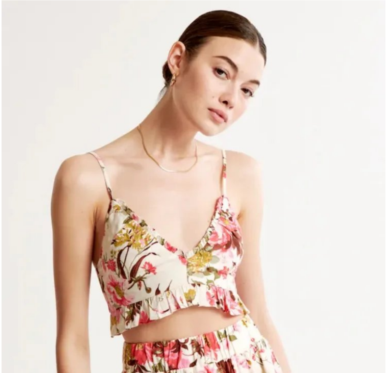
Abercrombie & Fitch Linen Blend Maxi Skirt, $70