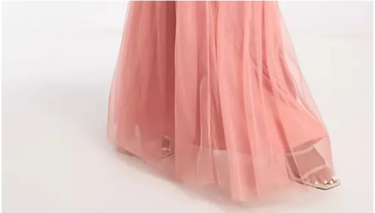
LoveShackFancy Raleigh Mini Dress, $345