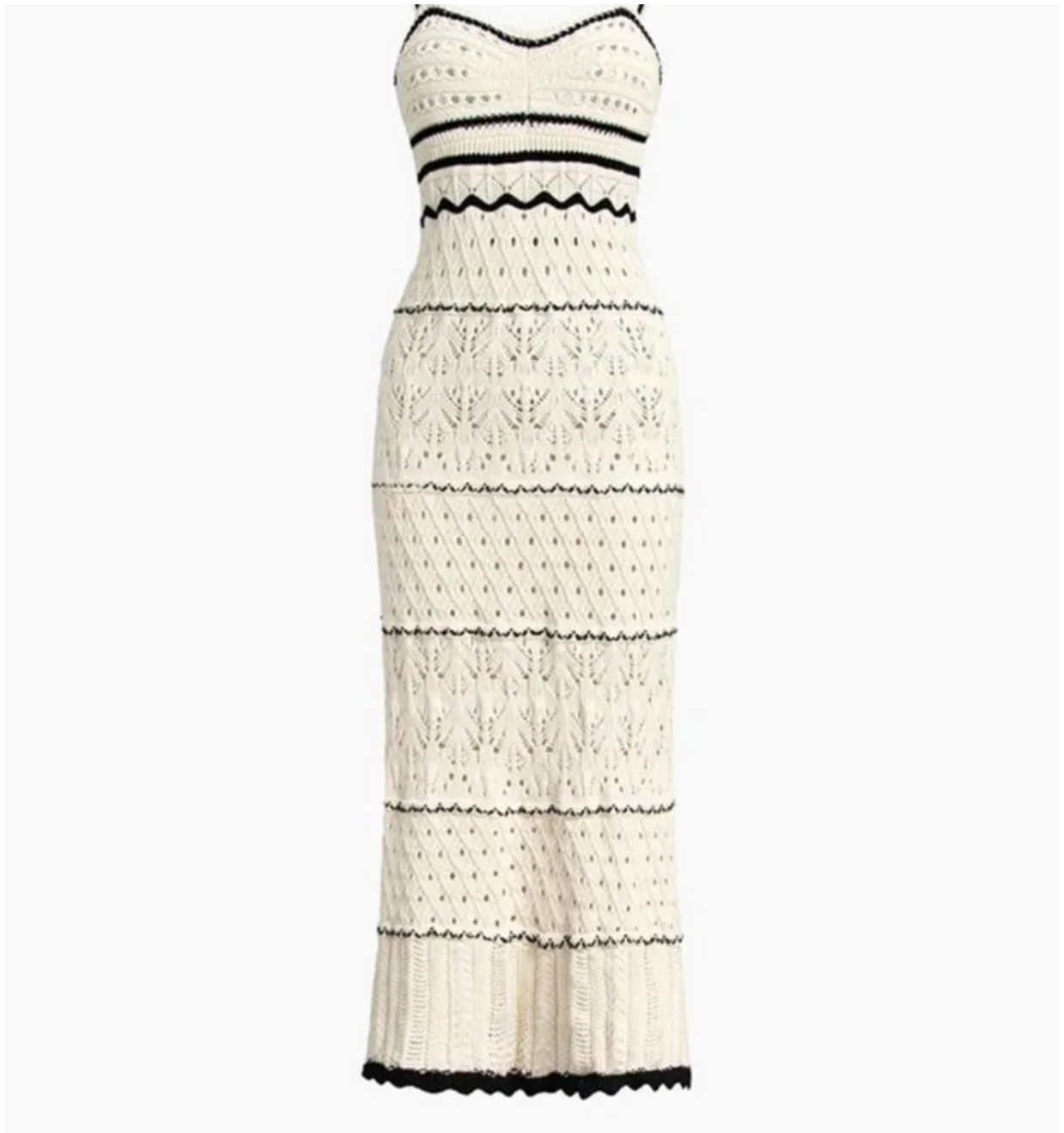
LSPACE Sweetest Thing Crochet Maxi Skirt, $165